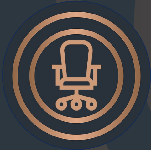
Directors & Officers Liability